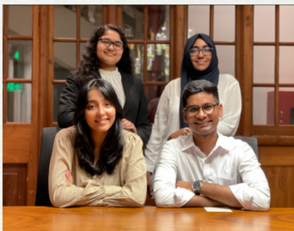
The IIMC Colombo 2022 Working Committee

The success of IIMC 2022 can be attributed to the many organizations which endorsed and supported this endeavour, such as the United Nations Commission on International Trade Law Regional Centre for Asia and the Pacific ( UNCITRAL RCAP ), Ministry of Justice of Sri Lanka , and the International Mediation Institute ( IMI ) together with the Young Mediators' Initiative ( YMI ).