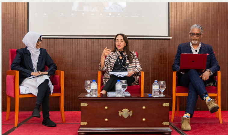
Panel Discussion I at IIMC Colombo 2023

in-person in the heart of Colombo, Sri Lanka.