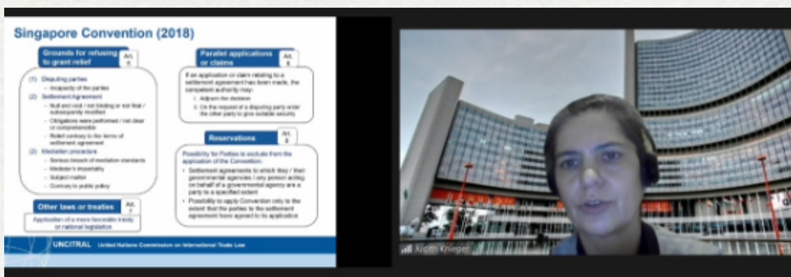
A webinar on UNCITRAL and the path to Investor-State Dispute Settlement, held in collaboration with the UNCITRAL RCAP and Sri Lanka Law College.

IIMC Colombo 2022, the inaugural edition of the World's Only Investor-State Mediation Competition, was held virtually from 10th – 18th January 2022, with the participation of 8 Mediator Teams and 16 Negotiator Teams from 11 countries across the globe, and also a number of expert assessors, drafters and panellists from around the world.