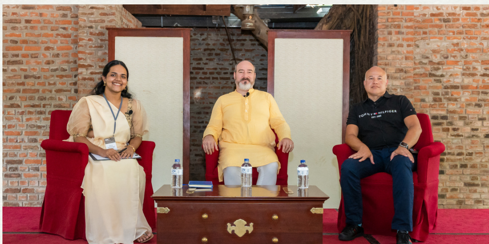
The Outdoor Chat at IIMC Colombo 2023